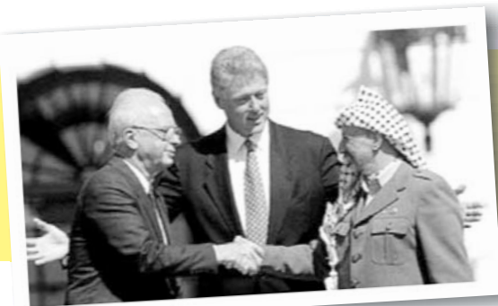
Yitzhak Rabin, Bill Clinton and Yasser Arafat after signing the Oslo Accords.

1993 Arafat sends a letter to Israel Prime Minister Yitzhak Rabin recognising Israel and renouncing terrorism. The Oslo Accords, negotiated secretly in Norway, are signed in Washington. The Accords establish a Palestinian Interim Self-Governing Authority to govern the West Bank and Gaza under a power-sharing arrangement pending negotiation of a "final status" peace agreement. Israel retains security powers in the Territories, and the final status negotiations are to deal with borders, settlements, Jerusalem etc.