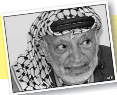
Yasser Arafat, Chairman of the PLO and first President of the Palestinian Authority.