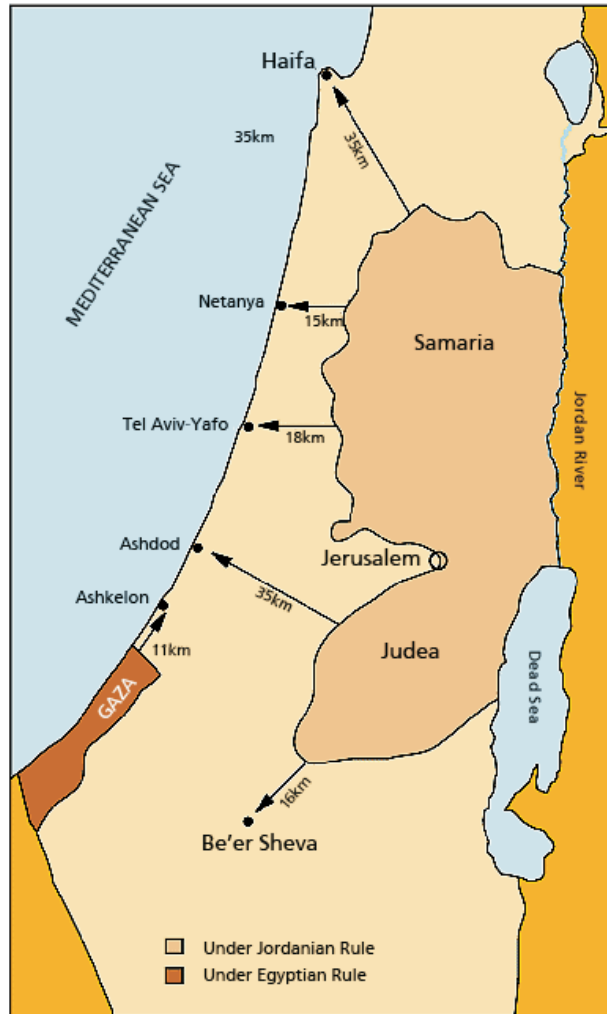
Distances between Israeli Population Centers and the Pre-1967 Lines