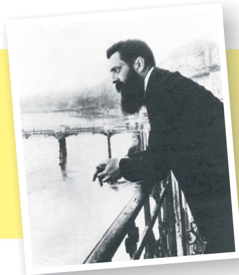
Theodore Herzl in Istanbul, before obtaining an audience with the Sultan to seek a Jewish homeland in Palestine.

1908 The city of Tel Aviv is founded. Communal agricultural settlements (kibbutzim) appear.