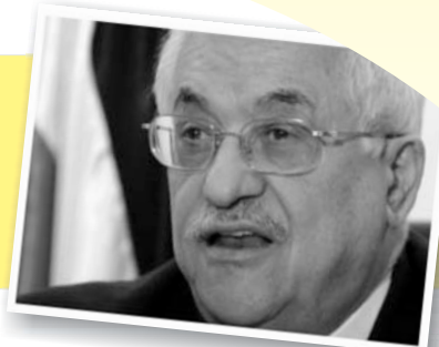
Mahmoud Abbas, President of the Palestinian Authority since 2004.

2006 In July 2006 the Hezbollah cross the border into Israel, and kill and kidnap Israeli soldiers. Israel responds with aerial bombardment, beginning with the bombing of the Hezbollah communications centre at Beirut airport. The Hezbollah fire rockets into Israel, reaching the city of Haifa, and launching rockets from Lebanese population centres. Israeli troops enter south Lebanon. and hostilities end with a UN Security Council resolution requiring the disarming of the Hezbollah and the presence of the Lebanese army and increased UN peacekeeper forces in the border area.