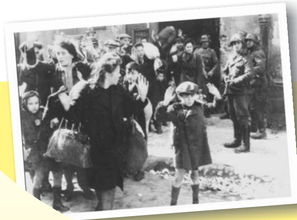
Rounded up in the Warsaw Ghetto for extermination.