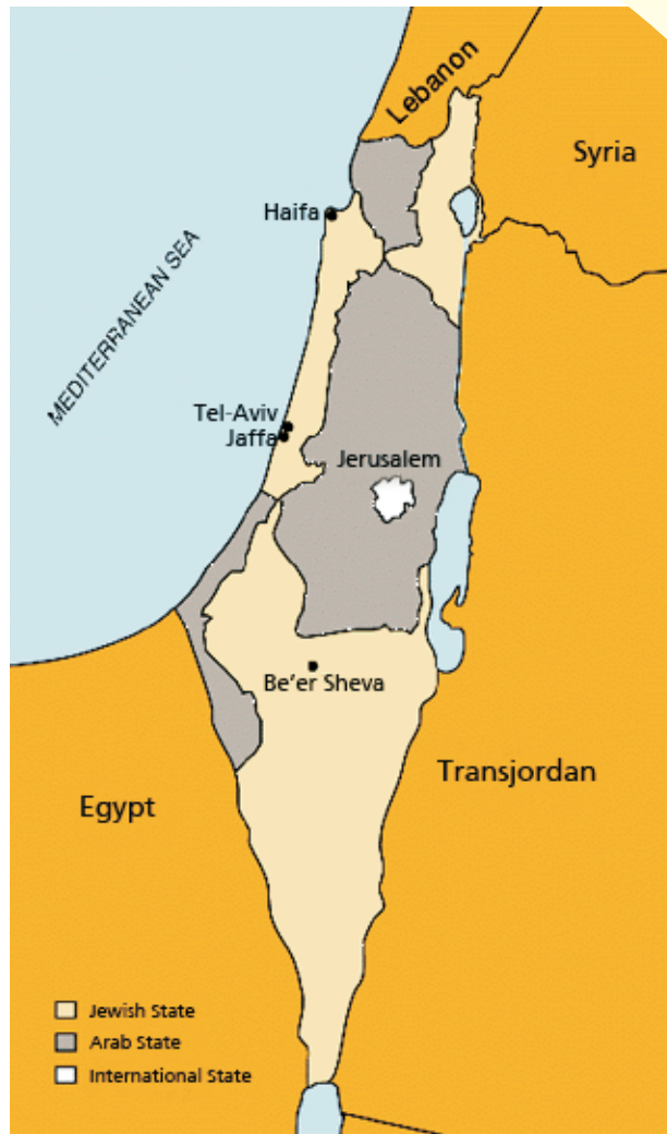
The Partition Plan, 1947 U.N General Assembly Resolution 181

The Partition Resolution was rejected by the Palestinian Arabs, who refused to establish a Palestinian Arab state alongside Israel. Hostilities commenced in 1947, and the neighbouring Arab states invaded in 1948. As a result no Palestinian state was established, and there was no international regime in Jerusalem.